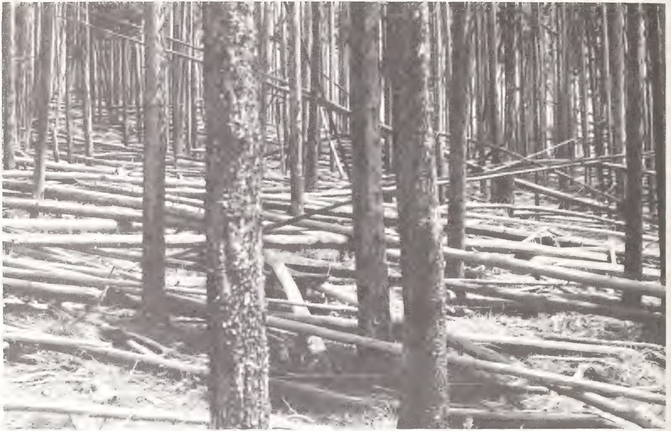
Figure 2.--Overmature lodgepole pine stands on the Bitterroot National Forest average about 4,100 ft 3 per acre of wood 3 inches and larger of standing and down material.

Forest habitat type is an important characteristic in evaluating management needs and productivity of the forest. The mature lodgepole pine stands included in this study are primarily in the alpine fir habitat types. Several other individual habitat types are also represented, but because there were relatively few samples in each, data were combined by major habitat series. The habitat types and areas are as follows: